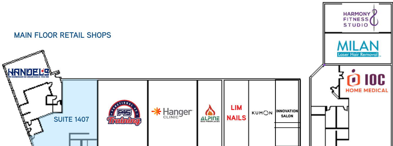
MAIN FLOOR RETAIL SHOPS